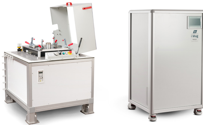
Automotive & Aerospace, For Axial Flux Motor